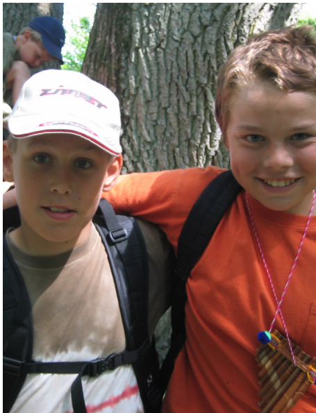
School visiting Porten till Alvaret

To catch the interest of children and grown ups Station Linné organise unique and learnfull nature tours with scientists between May and late August. Kids do not want to miss our nature experience programme – within the frame Porten till Alvaret – which we organise throughout the summer.