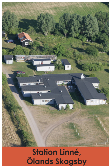
Station Linné, Ölands Skogsby

Öland is also an island with strong agricultural traditions. The southern part – an old agricultural landscape with coastal meadows, old village structures and a large area of limestone pasture (Stora Alvaret) – is a UNESCO World Heritage Site. Despite the high value of Ölands nature and the presence of a UNESCO world heritage, there is no facility yet on the island that offer visitors enrichment of their nature experiences.